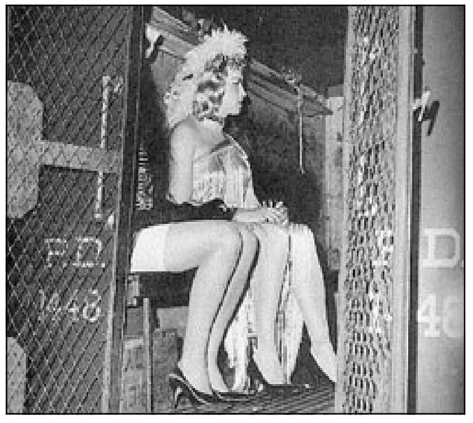
Transgender Stonewall rioters who would today be excluded from the modern corporate lobby group made in their name.

In their website literature they proudly explain that gay people perform better if they're "out" (exploitation is fine, as long as we're exploited as equals). This statement clearly doesn't match the experiences of those making a gender transition, 10% are verbally abused, 6% physically assaulted and as a consequence of this abuse around a quarter are forced to leave their jobs. Stonewalls focus is evidently only on gay people who identify with their current gender and they have no real or significant interest in lobbying for the rights of other vulnerable groups.