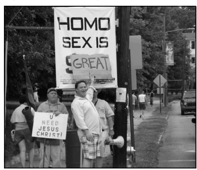
A vigilant member of the Gay community straightens out the facts.

Another example of homophobia and the left coming together is the Socialist Workers' Party's (SWP) role in Respect. Aside from receiving donations from a million-