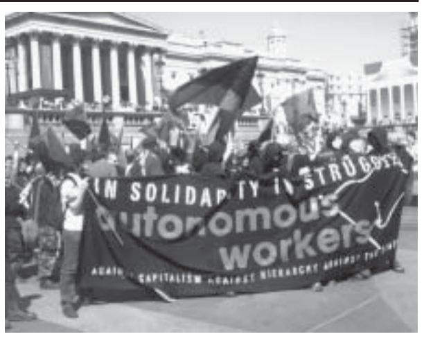
May day in London this year

There was international outcry and May 1st became established as an international day of solidarity and action by the American Federation of Labour, and this was supported by workers' movements, mainly in Europe. One hundred and twenty years later, this history has been conveniently forgotten. In the US, the State moved the date to September, and renamed it 'Labour Day', now known more for family BBQs on a long weekend than for any political association. In western Europe, it became the property of reformist political leaders and union bureaucrats and transformed into a meaningless ritual. Recently, some governments have