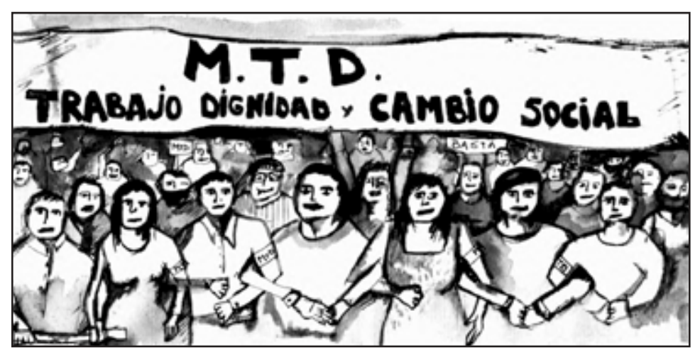
Drawing of unemployed workers calling for Work, Dignity and Social Change

THE ARGENTINA AUTONOMISTA Project have just finished a successful tour of Britain and Ireland. The tour consisted of an excellent puppet show telling the history of capitalism in Argentina and the resistance to it by the people.