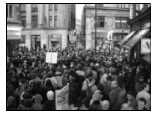
Mayday in Mayfair

Meanwhile, the Trotskyists of the SWP, through their front organisation Globalise Resistance (surely that's Demobilise Resistance?) had entered into an alliance with trade union bureaucrats and Stalinists for yet another boring demonstration marching from A to B. The most recent Maydays, for all their faults, were an attempt to get away from