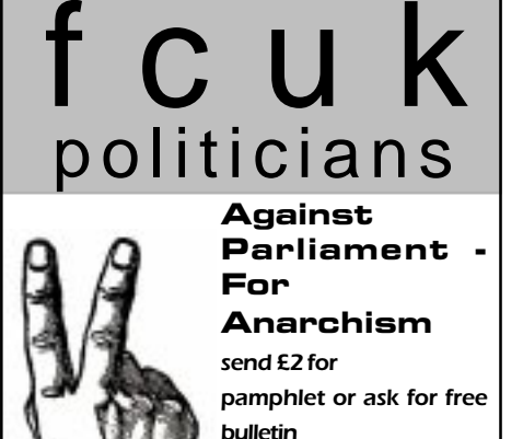
These stickers and more are available from London Anarchist Federation

Life's too short to give party politicians another chance, another 5 years. Lets start making real change now.