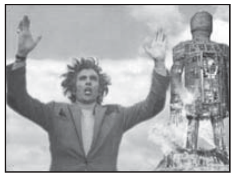
Christopher Lee shows a novel approach to dealing with the authorities

fixes" that don't tackle the causes. Nuclear power is a favourite, sold with the lie that it doesn't produce carbon dioxide. It's very dangerous, producing deadly waste with no safe storage solution, is vulnerable to terrorism and fuels the production of nuclear weapons. It is also so costly that it needs massive government subsidies and relies heavily on dwindling supplies of uranium. The industry has a long and infamous record of "accidents", near disasters (Windscale, Three Mile Island, Chernobyl) and health risks.