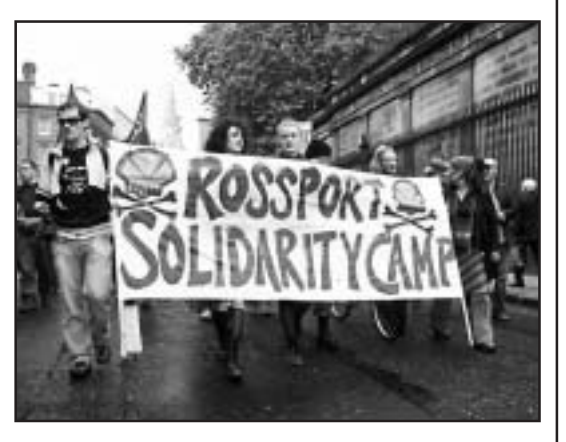
Top: A meeting at the Rossport Solidarity Camp; Above: A protest in Dublin against Shell's plans.