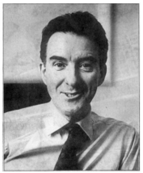
Peter Mandelson before the smug grin was wiped off his face.

More info from: London Greenpeace, 5 Caledonian Rd, London, N1 9DX, or visit: www.mcspotlight.org