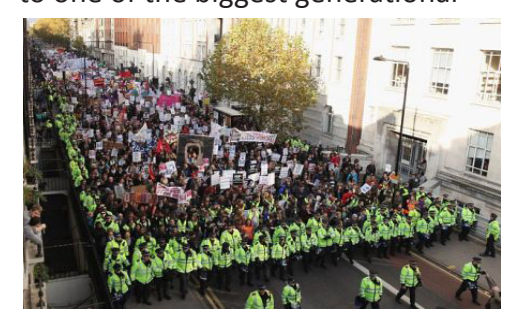
betrayals in peacetime history.

The students were out in force against tuition fees and cuts and privatisation of education for universities, colleges and schools, as well as the government's draconian and savage assault on the welfare system in this country. The government's attack on young people is not just by age but by class and it amounts to one of the biggest generational