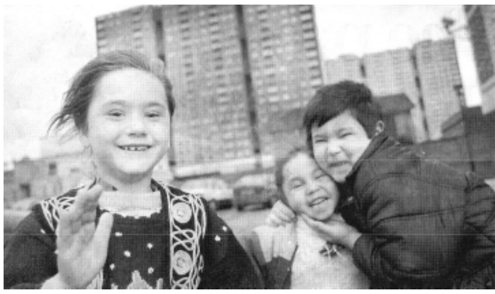
No, not these Roma kids in Glasgow, the real scroungers are the ruling class.

he media and press have been having a field day about refugees, par ticularly Roma: claiming that they are 'swamping' the country, part of criminal gangs, and demand money with menaces; they cynically have children with them when asking for money to exert moral blackmail (perhaps beggars should put their children in a creche?). They are also called 'benefit cheats' claiming money when they have jobs, and are said to be jumping the council housing queue.