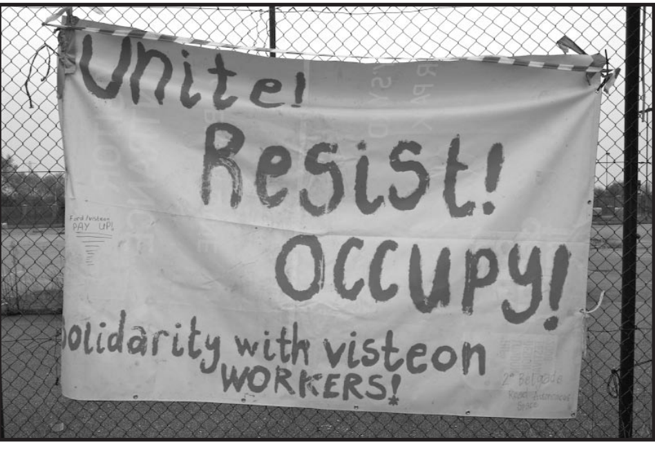
Support groups have sprung up around the workers at Enfield, Basildon and Belfast

http://doodle.com/7tgwd2akiyeas8id Or if you'd prefer to donate money, cheques can be sent to HSG at PO Box 2474, London, N8.