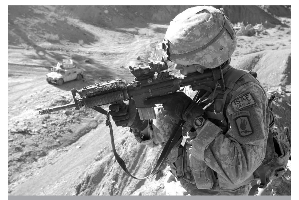
The cost of the 'war on terror':

Unlike the leftists who are content to cheer on people who would happily kill them, we do not pretend that Islamist ide-